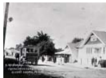
Alison's Corner, Takapuna library collection.

Even in the early days, the area around Takapuna and Milford Beaches and Lake Pupuke was where wealthy Auckland businessmen built homes for their families. These houses