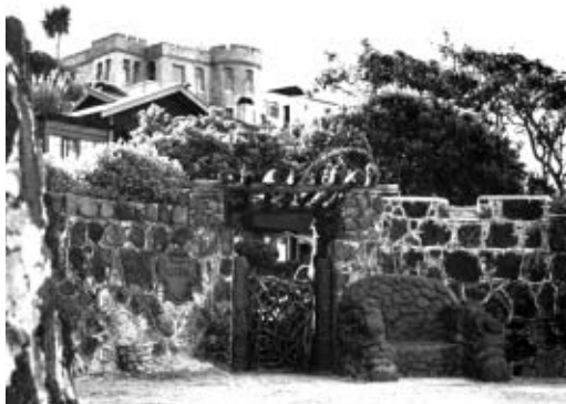
Giant's Chair, Takapuna library collection.

Walk across Thorne Bay. Local residents in the 1930s-40s clubbed together to form concrete footpaths over some of the rougher surfaces. You will see natural drains flowing from Lake Pupuke into the sea. You can reach the main road from any of the side streets or continue along the rocks (be prepared to climb over rocks) to see the Fossil Forest.