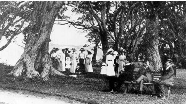
Takapuna library collection.