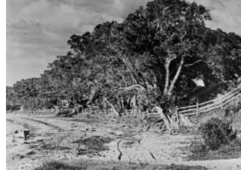
Takapuna library collection.