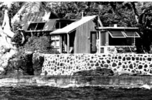
Chapple House, 1969, Joan Chapple.

The multi-layered building which steps down the slope to the beach is the result of a combined effort by professionals, family and helpers. It resembles 'a collection of army huts' with weathered exterior walls and an aluminium roof. This house was built at a time when architects were experimenting with a New Zealand identity. It represents a progression from the simple style of Vernon Brown's Early Modern house (see 14) to a New Zealand architecture that is more complex in its response to our environment.