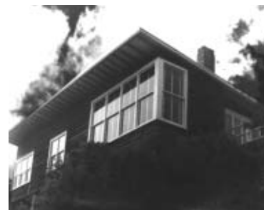
University of Auckland School of Architecture library collection, 1942.

Built in the 1940s on a steep site overlooking Black Rock. It was designed by architect Vernon Brown who was one of the first to grapple with designing buildings that respond to New Zealand living conditions and explore a distinctly New Zealand style of architecture. This house is a superb example of his philosophies. Low single pitched roof, dark creosote boards and tall double hung sash windows, were hallmarks of his style. Together they form a simple shed-like building that perches precariously on the shore and opens out to the sea and towards Rangitoto.