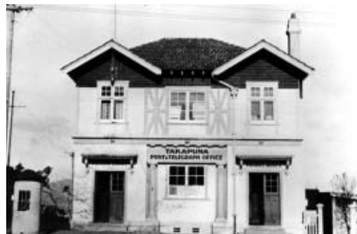
Takapuna library collection.