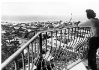
View from one of The Circle apartments 1968

The circular apartment building peering out above the trees was built in 1968 and was recognised as the first apartment tower in New Zealand to have 360° views. At the time, it was an impressive 11 storeys high with 12 apartments and took two years to complete. Named 'The Circle', it was built on the site of 'Maratea', the Goldie family's summer house. Charles Goldie, the acclaimed painter of Maori portraits made considerable use of the studio his father had built for him there. Tales of parties and weekends held at the house have become legend among Shore residents. Two Norfolk pines, traditionally planted in pairs, were retained when the ageing house was demolished to make way for The Circle. However, lightning struck one of the pines in 1969 so only one can be seen standing tall, as if competing in height with The Circle today.