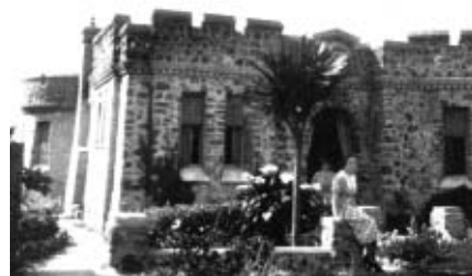
Takapuna library collection, late 1920s.