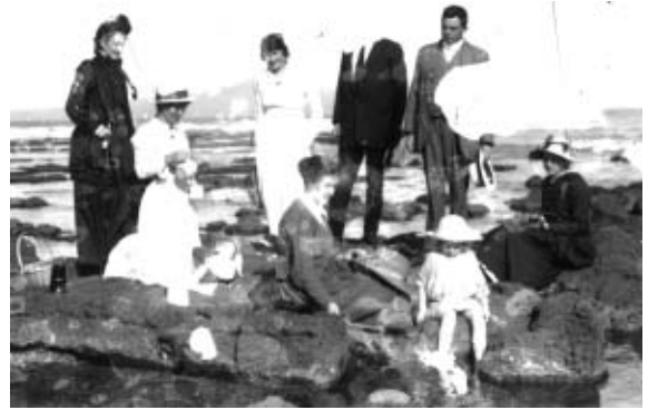
Picnic on the rocks, early 1900s.

At low tide the remnants of 500 tree stumps can be seen on the reef by the boat ramp. These tree moulds formed when fluid lava congealed around standing trees. Most of the lava then flowed away, leaving isolated stumps of basalt where the trees once stood. It is New Zealand's only example of a fossil forest.